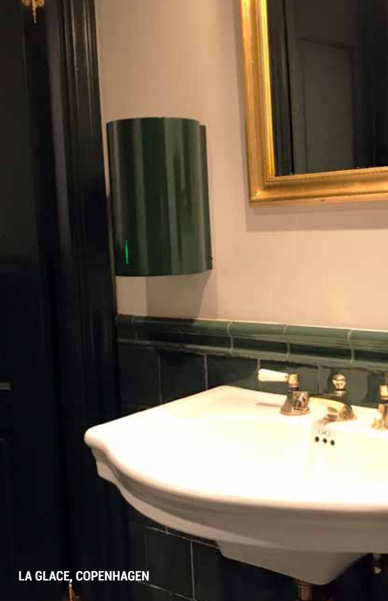
LA GLACE, COPENHAGEN