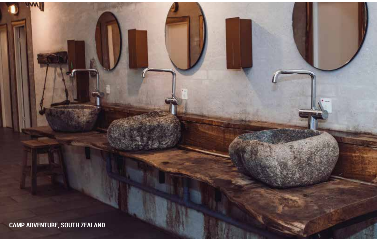
CAMP ADVENTURE, SOUTH ZEALAND