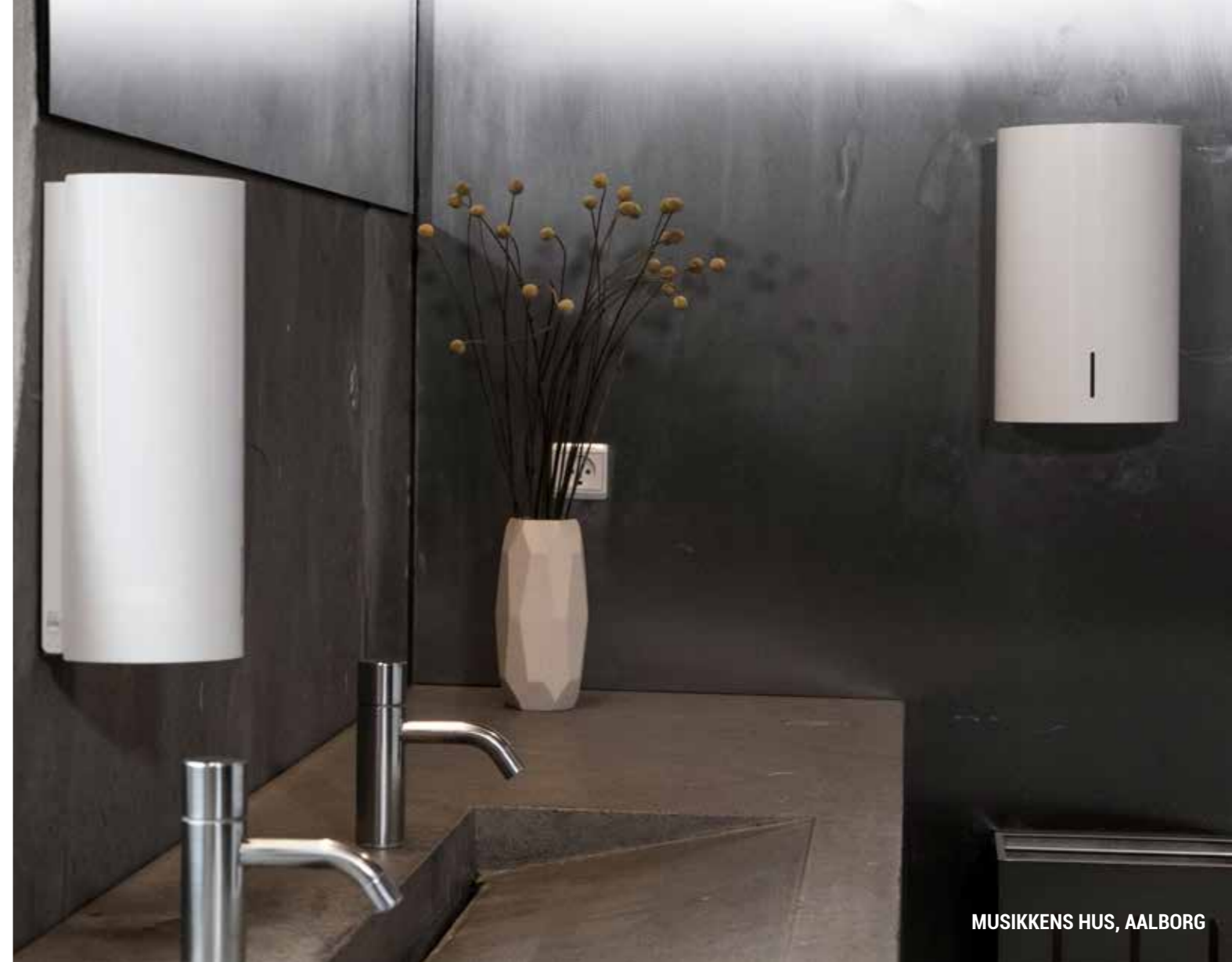
MUSIKKENS HUS, AALBORG