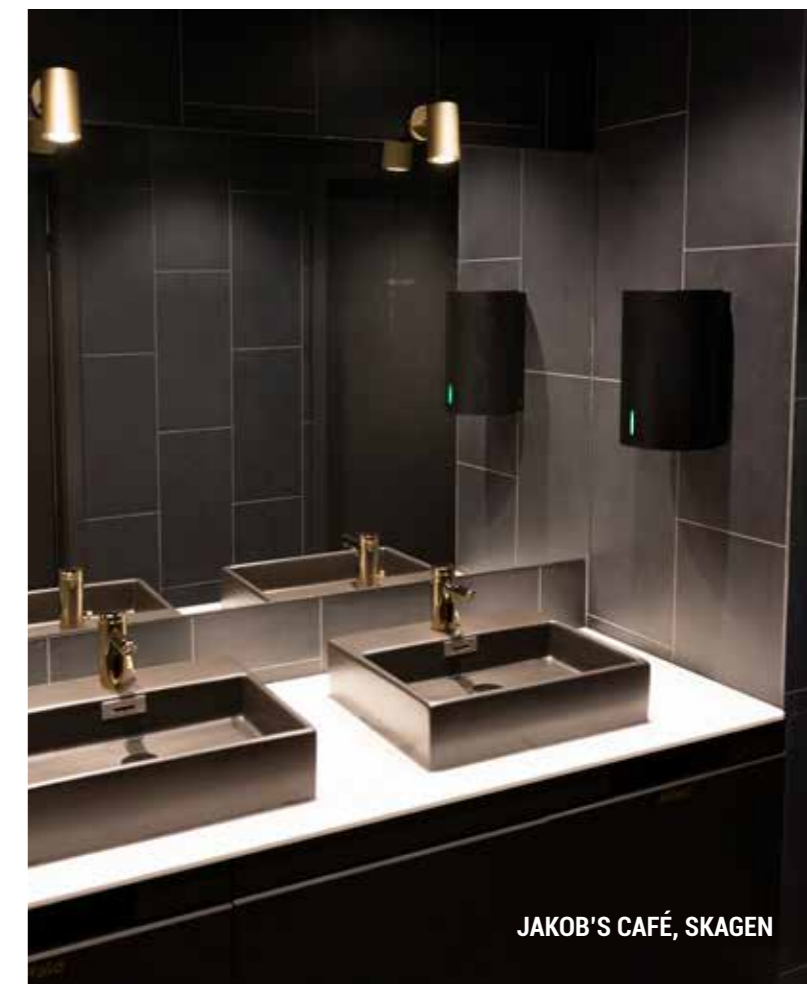
JAKOB'S CAFÉ, SKAGEN