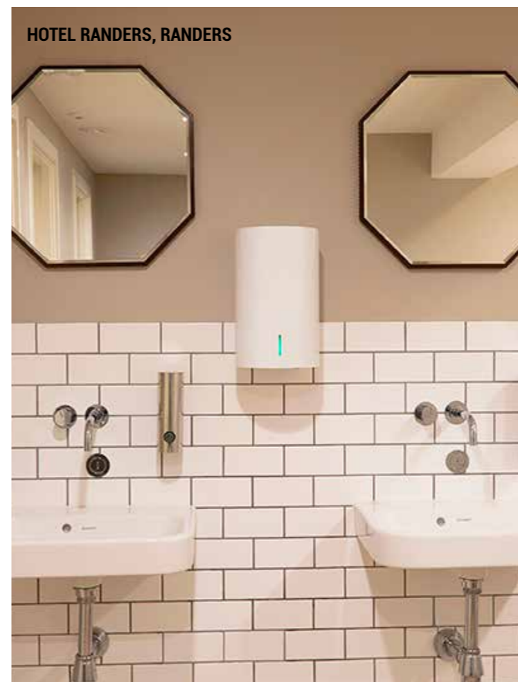
HOTEL RANDERS, RANDERS