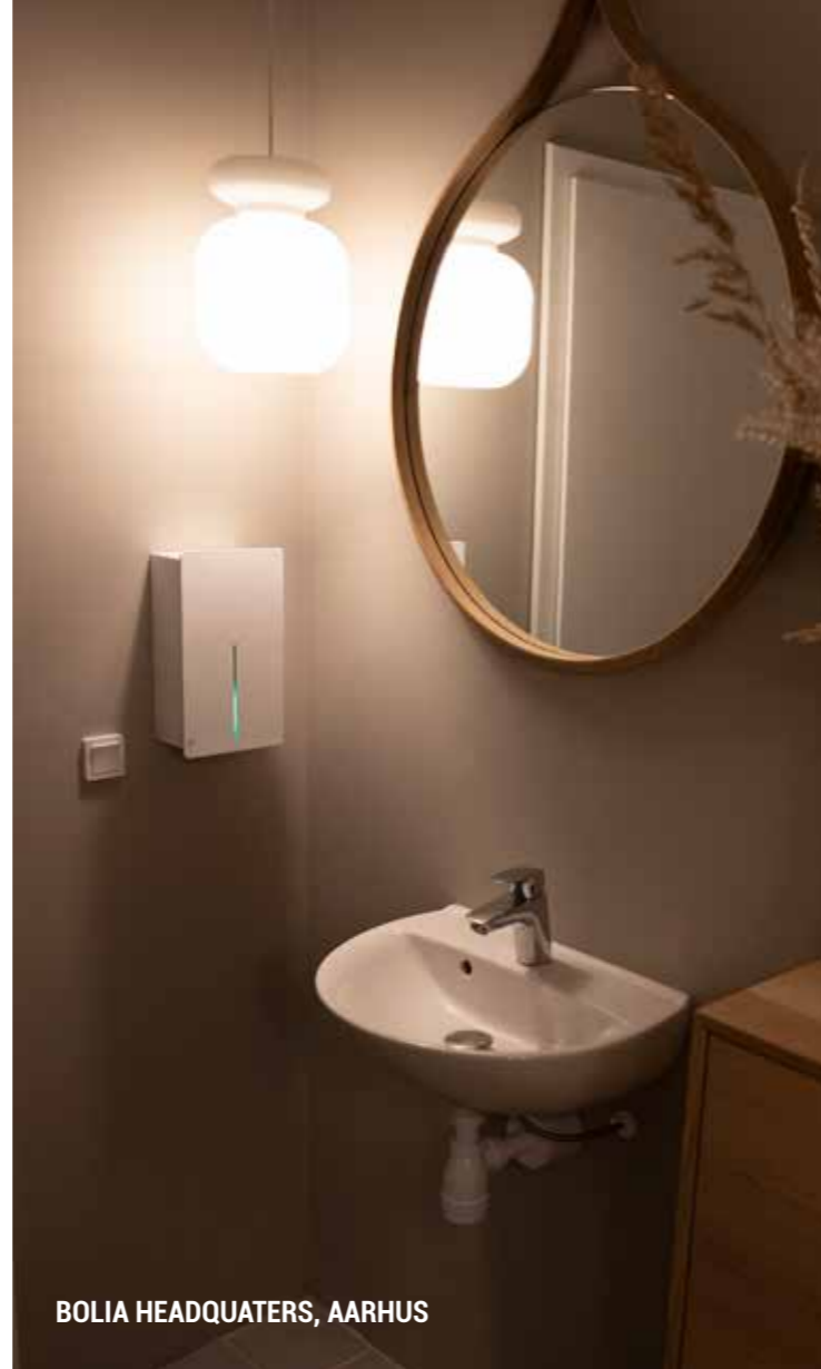
BOLIA HEADQUATERS, AARHUS