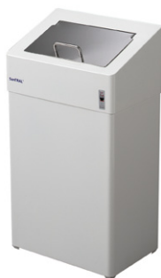
DAN DRYER sanitary bin Floor model or for wall-mounting Capacity: 18 l Art. no. 1101 – powder-coated white