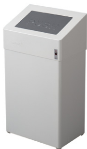
DAN DRYER waste bin Floor model or for wall-mounting Capacity: 18 l Art. no. 1111 – powder-coated white Art. no. 1110 – brushed stainless