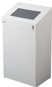
DAN DRYER waste bin Floor model or for wall-mounting Capacity: 50 l Art. no. 1112 – powder-coated white Art. no. 1113 – brushed stainless