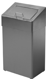
DAN DRYER sanitary bin Floor model or for wall-mounting Capacity: 18 l Art. no. 1102 – brushed stainless